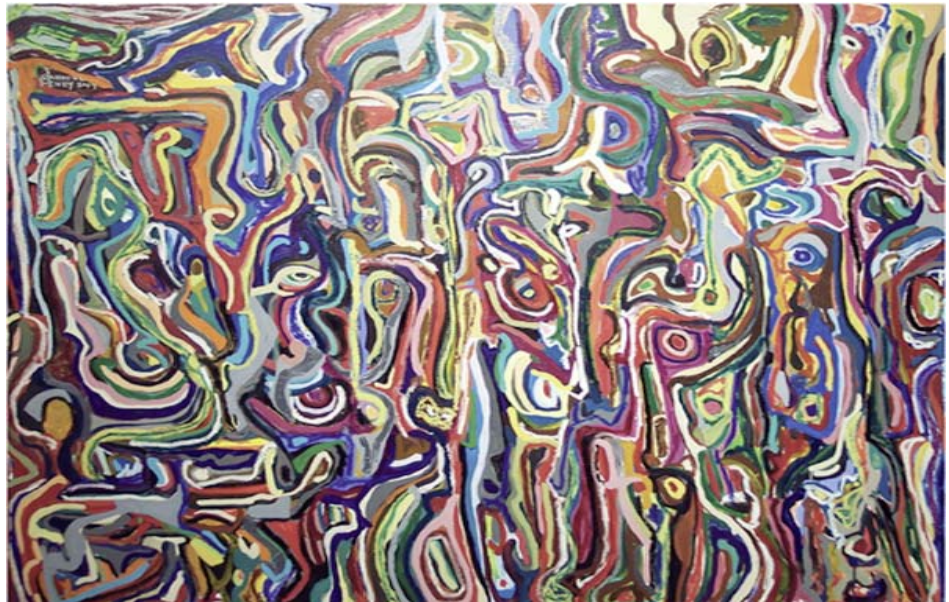
Image: Land of Bright and Dark Places , Acrylic and oil paintsticks on canvas, 50 x 61”, 2007

I enjoy watching forms appear and disappear and come back in new ways.