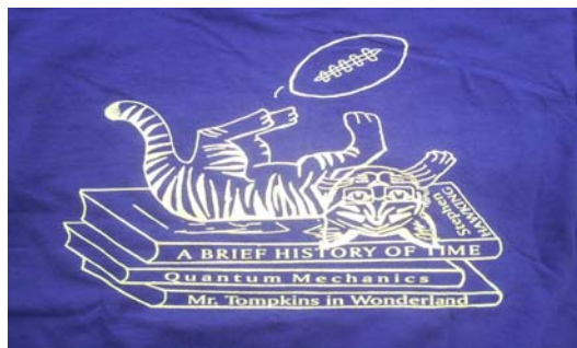
Physics T-Shirt Design