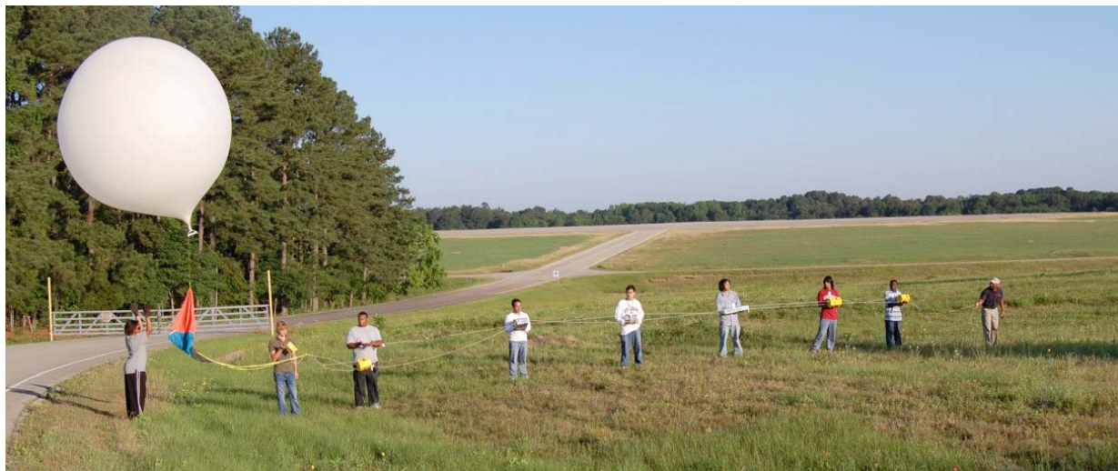
Launch of the ACES-09 balloon vehicle on May 20, 2008

NeD was flown on the ACES-09 vehicle which was launched just a couple of minutes before ACES-10 at 7:40 am from the NASA Columbia Scientific Balloon Facility in Palestine, Texas. Both vehicles required quite a chase and, unfortunately, communication with ACES-10 was